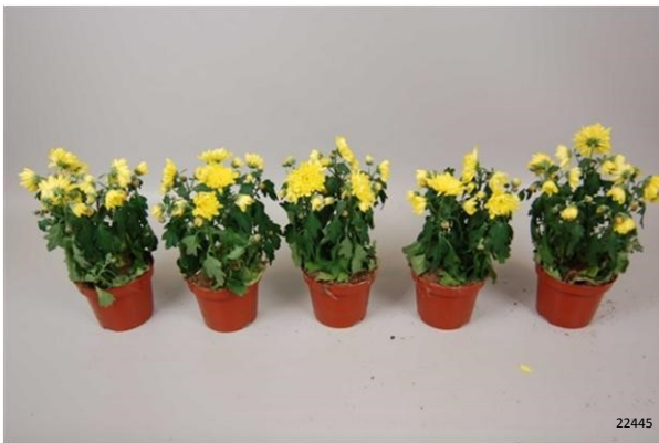
Control Photo taken: day 14