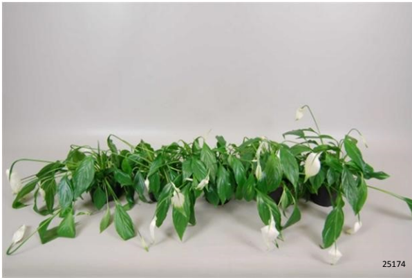
Control Photo taken: day 8