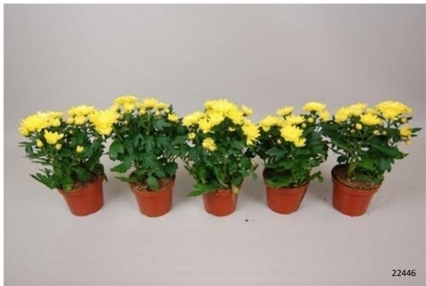
Treatment: Chrysal LeafShine & Seal Photo taken: day 14