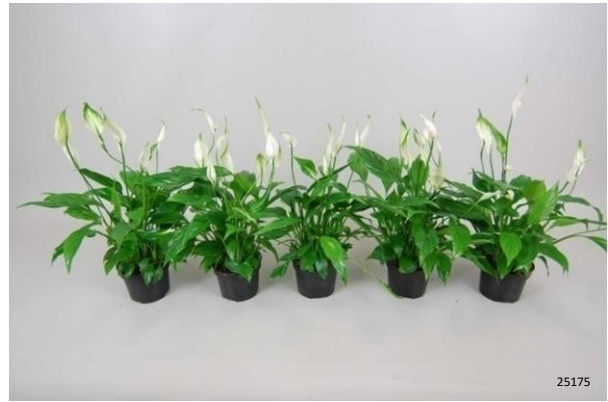
Treatment: Chrysal LeafShine & Seal Photo taken: day 8